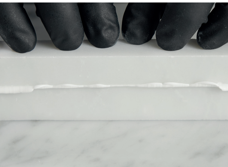
Bonding the material