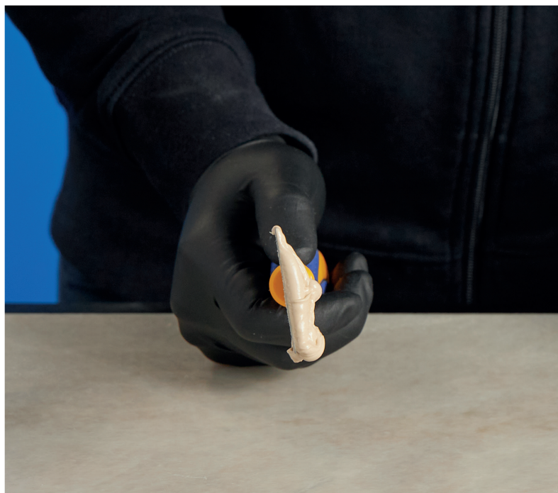
Post mix verticality