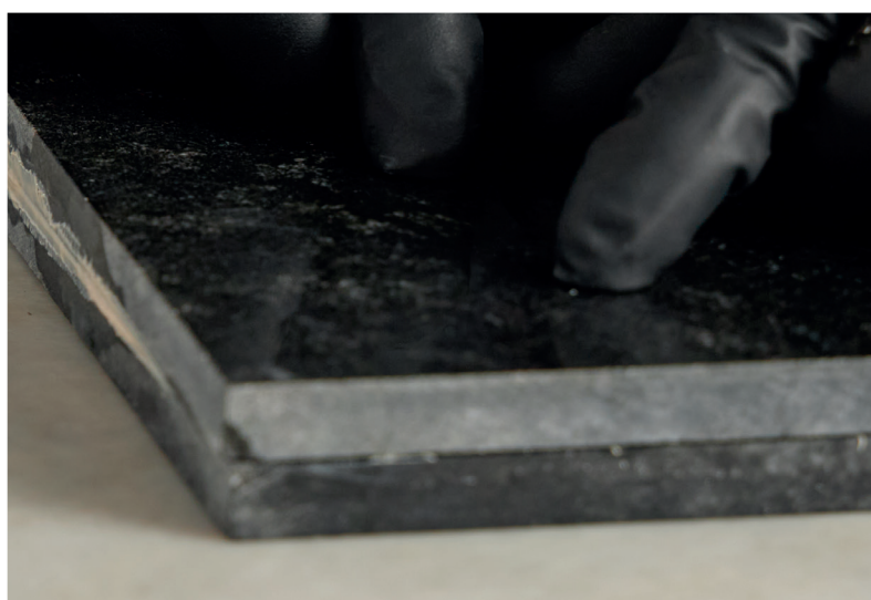
Hardened product appearance