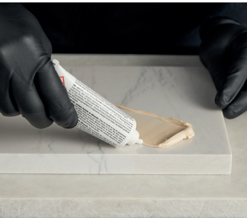
Addition of hardener