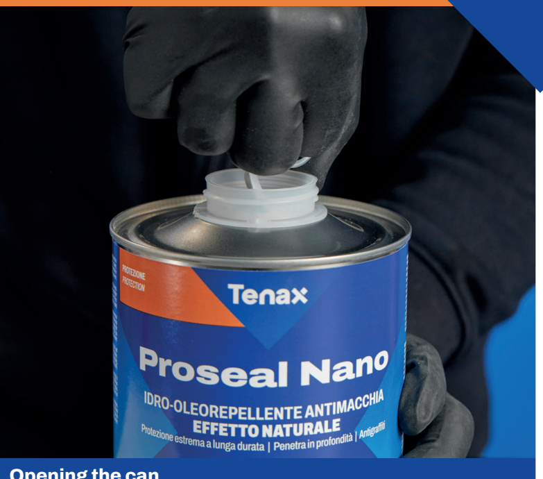
Opening the can