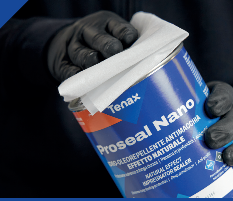
Dampen the cloth