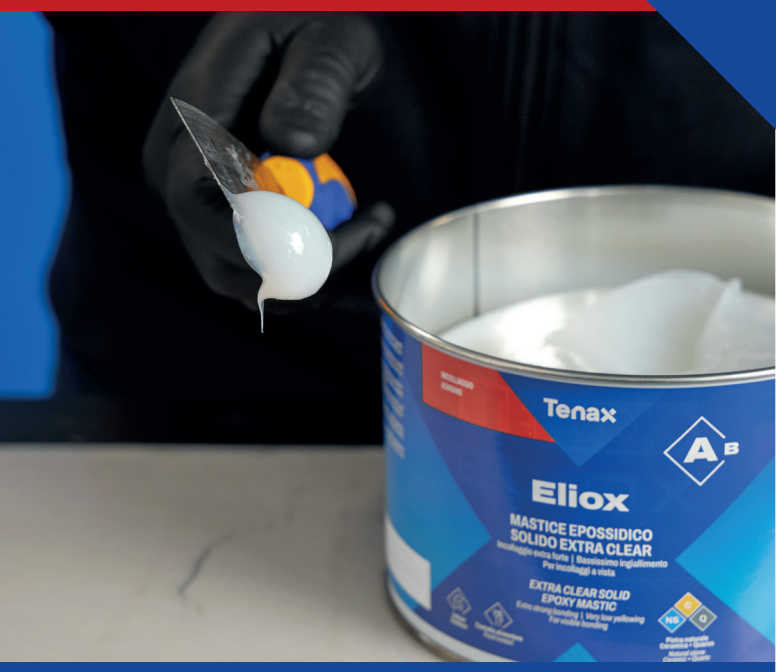
Part A Part E